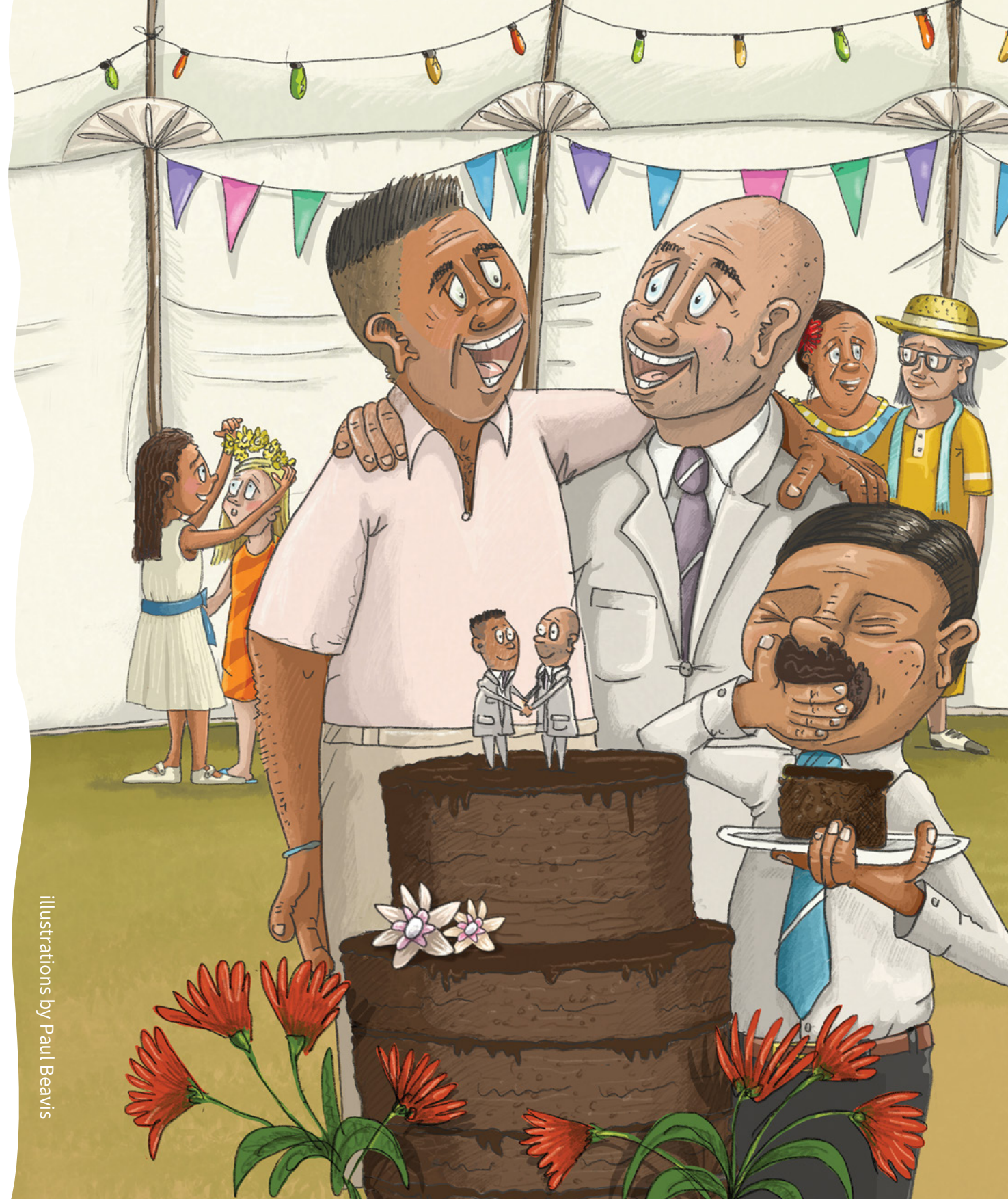
Illustrations by Paul Beavis